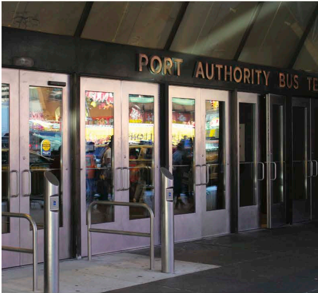
Port Authority Bus Terminal, New York City, NY, United States