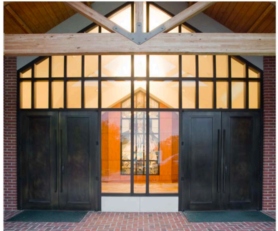
Saint Isidore Church, Baton Rouge, LA, United States